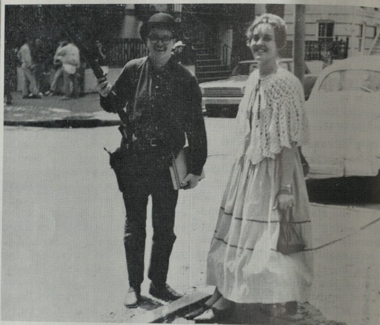
Two brave pioneers scout Indians outside the Dump