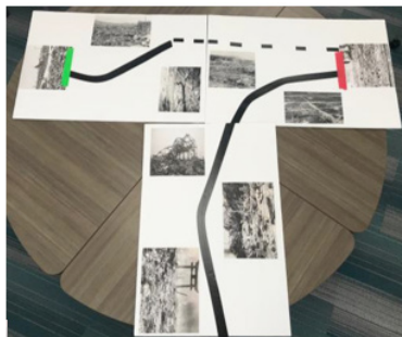
Figure 3. View of the Final Challenge course.

Students were asked to collaborate to complete this task and informed they would present their solutions to the entire class and teachers at the next session. The remaining class time was devoted to writing (approximately 30 minutes) and time to complete the proposal was provided during their regularly scheduled support time at school (teachers reported an additional 30-45 minutes was provided).