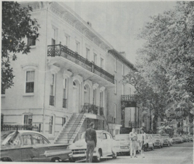
View of Gordon Row from Hunt Building looking East to Whitaker.