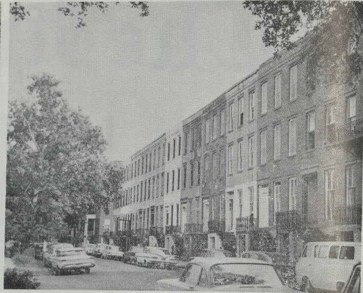
A view of the Gordon Row from Barnard Street to Whitaker Street.