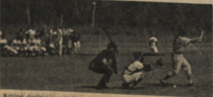
Action during a recent game on the Armstrong diamond.