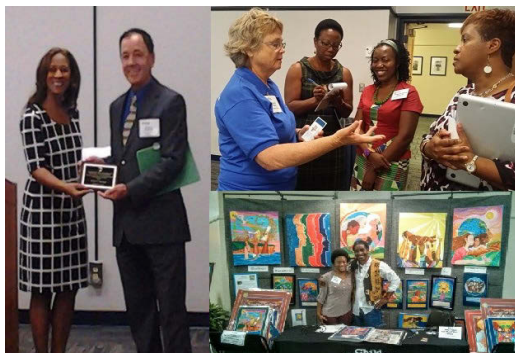
Scenes from the Summit