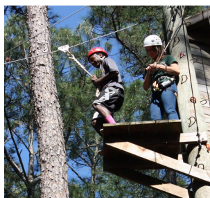
High schoolers went through Southern's Challenge Course before touring the campus.

Riding a zip-line through a remote forested area of Georgia Southern University's campus is not a traditional path to a college education, but for a group of 14 year-old boys it may have been just what they needed.