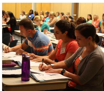
Above and left: Clinical Supervisors getting the most out of this month's "Clinical Camp."

More than 100 Clinical Supervisors and 20 College of Education faculty discussed best practices for mentoring teacher candidates at a day-long "camp" coordinated by COE's office of undergraduate teacher education. In addition to discussions on development of the teacher candidate and how to be a successful Clinical Supervisor, educators received updates from faculty and staff on edTPA ( see related article below ).