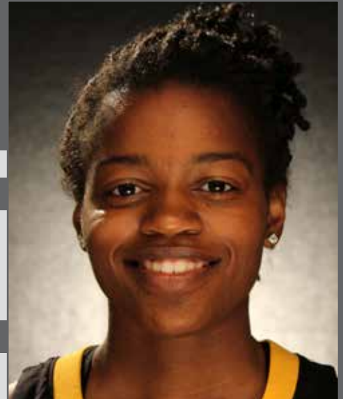
DAVIS' GAME HIGHS