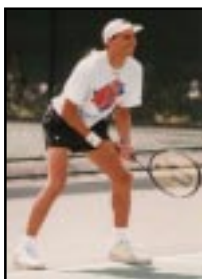
NCAA Division II Singles Champion 1992