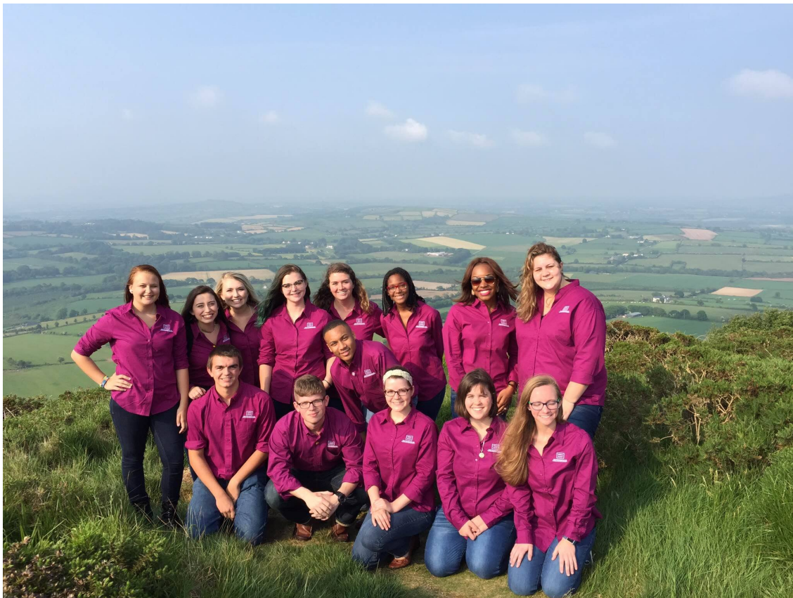
The Honors Inquiry in Ireland Study Abroad Trip