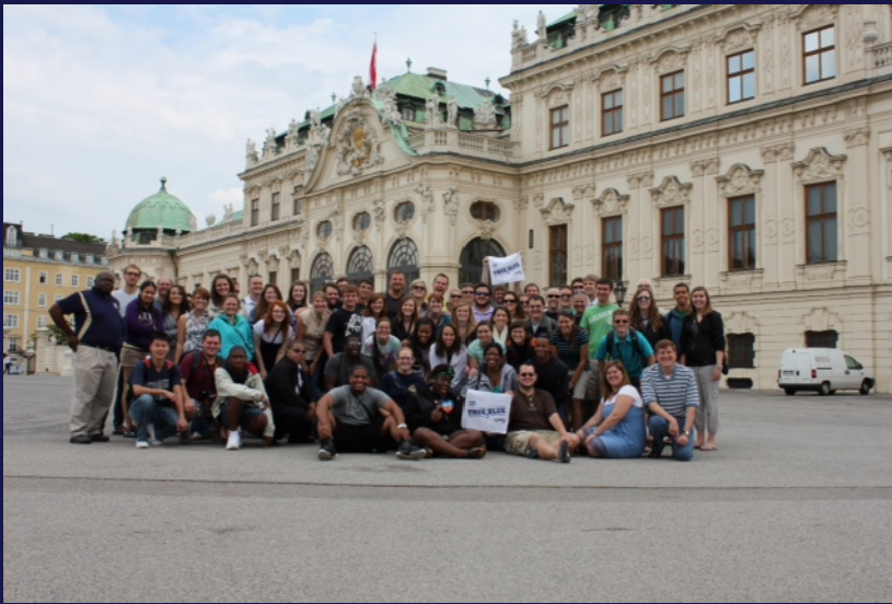
Students and faculty at Belvedere Palace, Vienna, Austria

Palace and visited the graves of famous composers in the Zentralfriedhof.