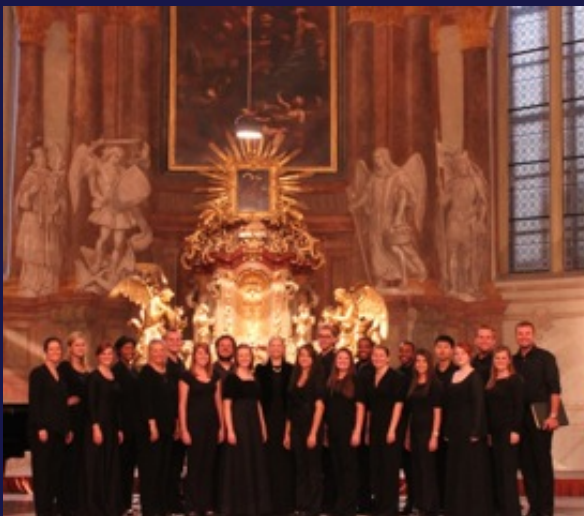
The choir in the Church of Simon and Judah, Prague

Members of the GSU and Katzelsdorf groups enjoyed the music and camaraderie, particularly when the local students joined with the combo.