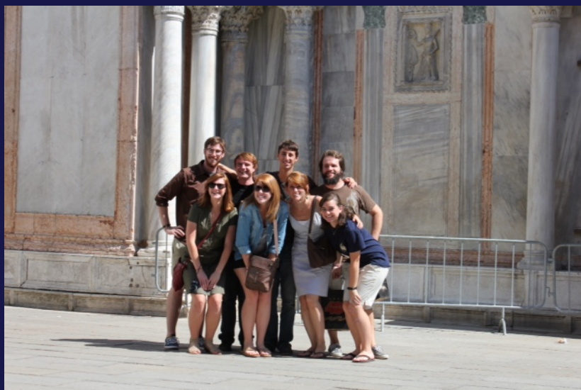
Students gather in St. Mark's Square, Venice