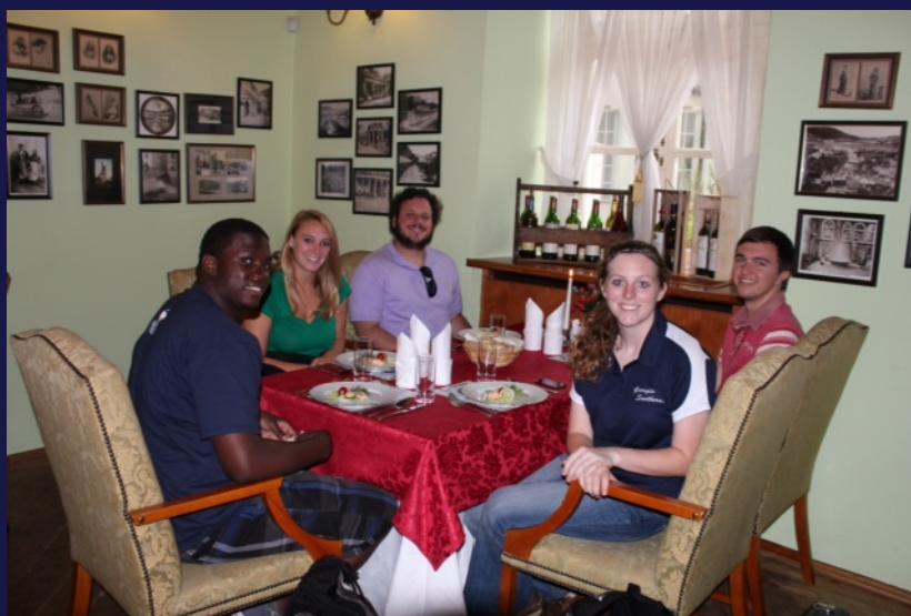
Students at farewell dinner, Posthof, Karlovy Vary