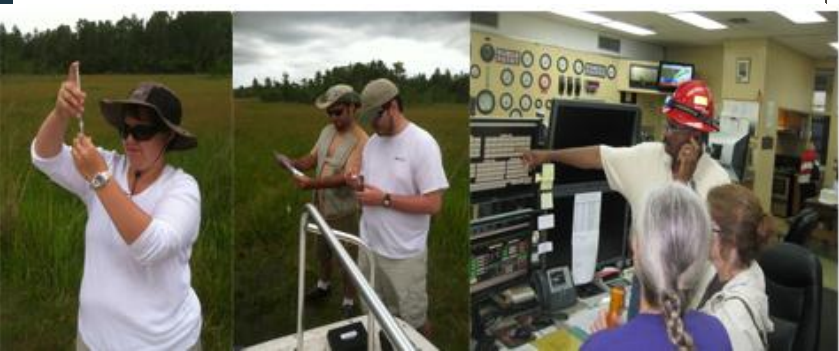
Scenes from COE's Summer TQ Workshops

A key component of each program is providing teachers with practical, user-friendly instruction and examples to take back to their classrooms, and continuing the link between faculty and participants through additional workshops and web-based interaction.