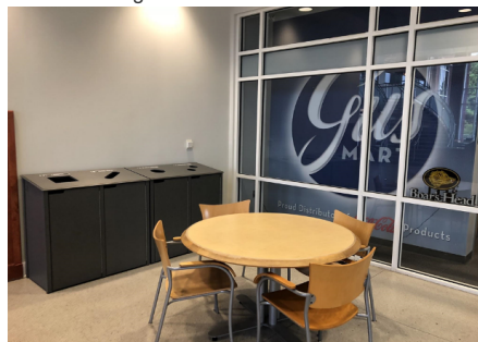
Retrofitted Recycling Receptacle in the College of Engineering and Information Technology