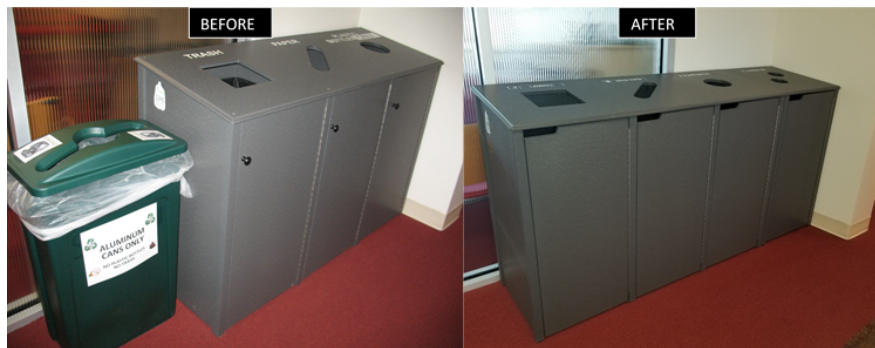
Recycling Receptacles in the Facilities Services Administration Building before and after Sustainability fee retrofit grant project

Facilities Services retrofitted and added 41 recycling receptacles in 15 buildings on campus. This included changing out the tops and adding an additional section to replace the small green bins that were previously located by each station for aluminum can collection. Each compartment has a restrictive opening unique to the type of material that is being recycled. The restrictive openings of the recycling receptacle allow users to easily identify waste streams on approach based on the openings. The recycling receptacles retrofitted are Max-R products. Max- R products are made of 97% recycled milk jugs in a manufacturing facility powered by 100% renewable energy. Through the Max-Reclaim™ program, the old top of each receptacle was reclaimed by Max-R guaranteeing the material will not end up in a landfill and continue the product life cycle.