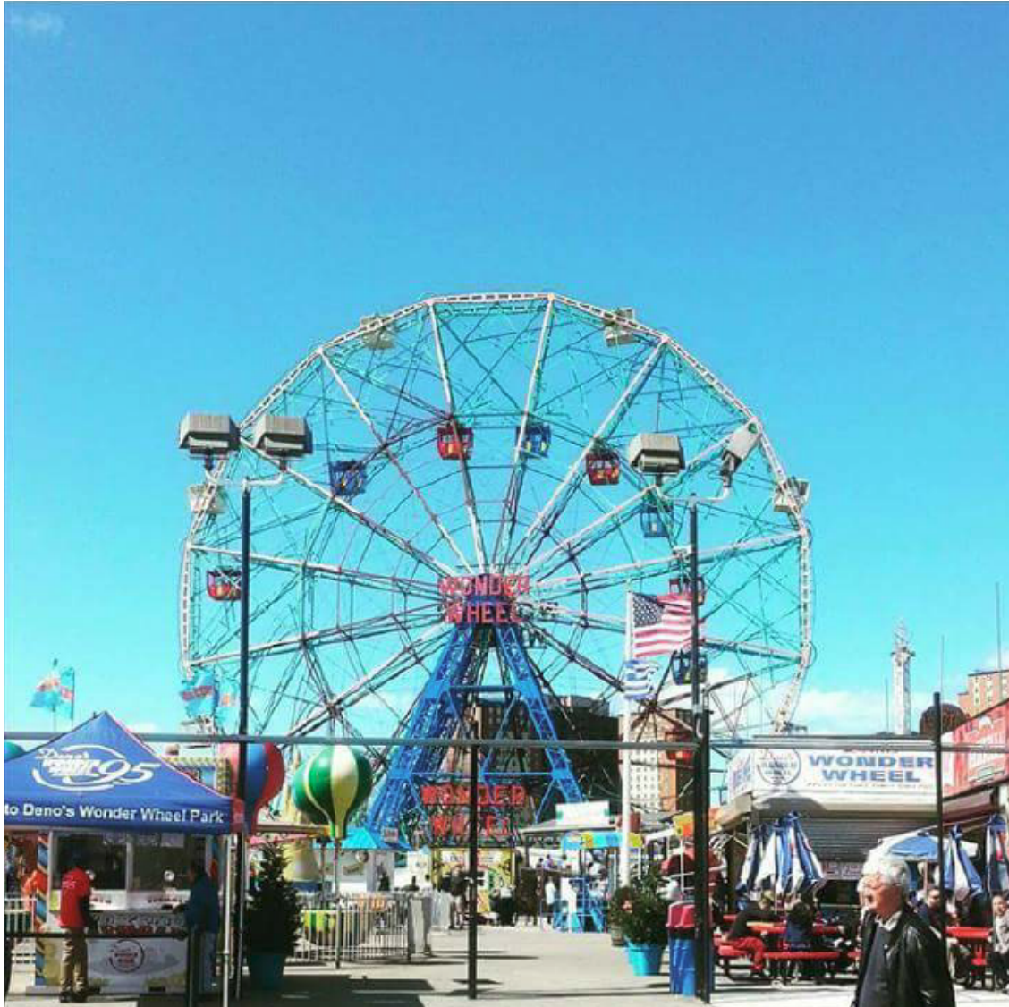
Coney Island's iconic Wonder Wheel.

Poet Lawrence Ferlinghetti's "A Coney Island of the Mind" wistfully looks back at a September day spent wandering Coney Island's boardwalk amidst jellybeans and licorice sticks, a time of youthful innocence now lost, retrievable only by memory. Since the publication of this poem in 1958, Coney Island has also moved past its prime, its original splendor existing only in the minds of those who had the privilege