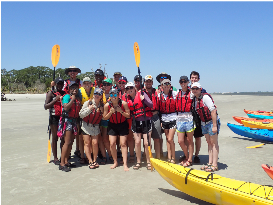
Honors Alternative Break campers gearing up for a kayaking adventure