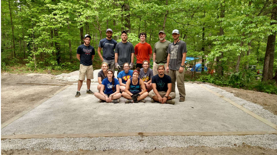
Honors students in Daniel Boone National Forest