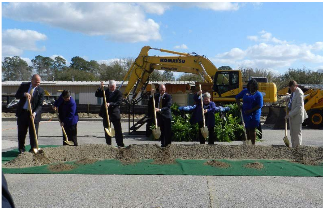
"IAB Groundbreaking Ceremony" February 24, 2017