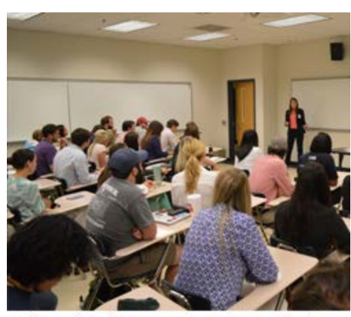
Sales students listen to a sales professional talk about résumés, interviewing, and professional dress.

The Center for Sales Excellence presented the first Eagle Sales Showcase for its sales students on April 29–May 1, 2015. Designed to allow graduating sales and sales management students an opportunity to learn through workshops and interactions with sales professionals, the three-day event celebrated the sales profession and included all-access opportunities with sponsors Aerotek, CH Robinson, Enterprise, Graybar, Nolan Transportation, and Tom James Company.