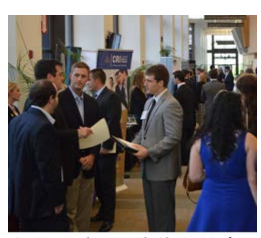
Accounting students network with accounting firms during the 25th Annual Accounting Day.

The Zeta Delta Chapter of Beta Alpha Psi and the Georgia Southern University Accounting Association sponsored the School of Accountancy's 25th Annual Accounting Day Awards Banquet on Wednesday, April 29. The evening's events began with a career fair for accounting majors that included twenty-five accounting firms and professional organizations with more than 60 industry representatives who met with students to discuss full-time positions and internships. The evening ended with the annual awards