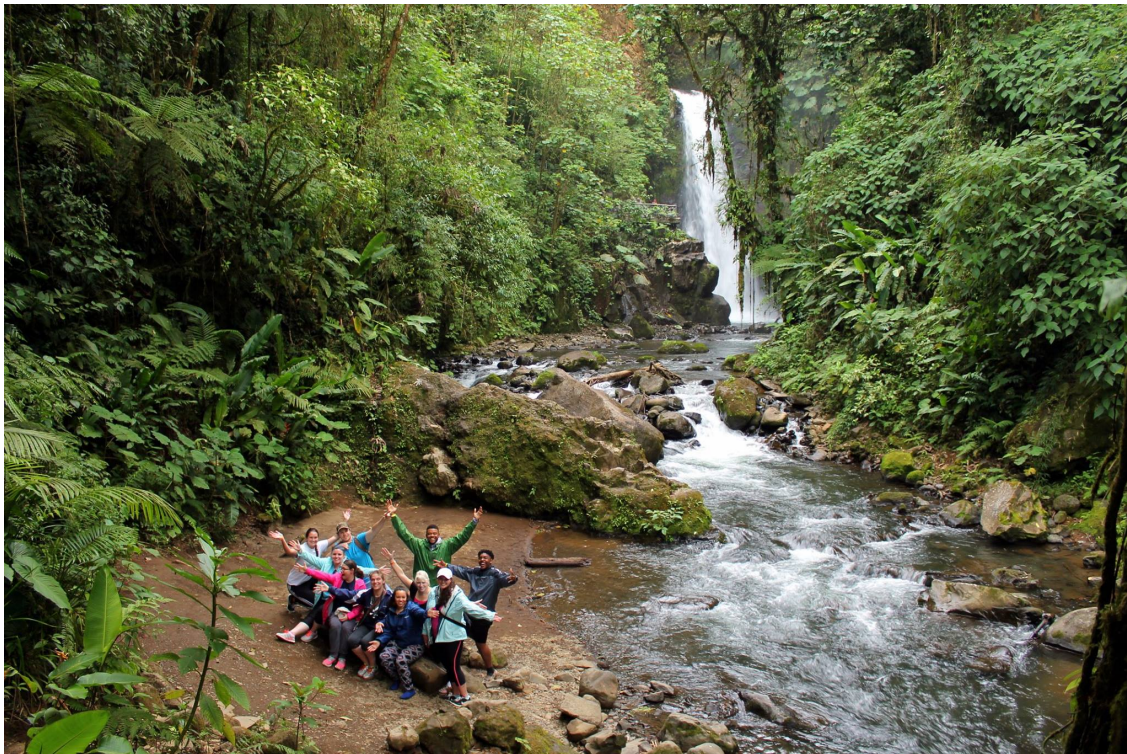
Georgia Southern students at La Paz Waterfalls