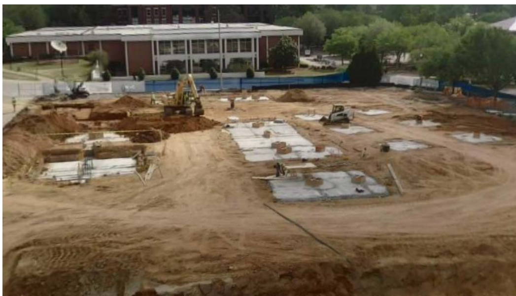
"Project is on schedule and on budget" (Most recent photo taken April 21, 2017)