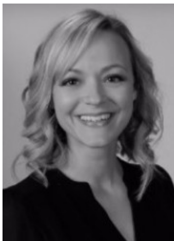
Director of Business Operations