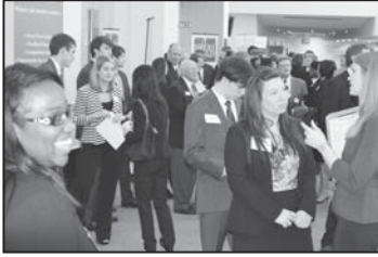
Job Fair Attendees

The Zeta Delta Chapter of Beta Alpha Psi and the Georgia Southern University Accounting Association sponsored the School of Accountancy's 23 rd Annual Accounting Day Awards Banquet on May 1. The evening's events began with a career fair for accounting majors. Twenty-two accounting firms and professional organizations with more than 50 industry representatives met with students to discuss full-time positions and internships. The evening ended with the annual awards banquet at which the School awarded scholarships.