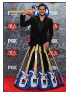
Luke Bryan and ACA "guitars"

His outstanding success is no surprise to his family who wanted him to move to Nashville following graduation from Lee County High