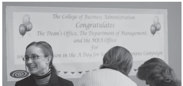
A reception was held in COBA November 9 to celebrate the Dean's Office, the MBA Office, Department of Management, and Office of Publications & Faculty Research Service's 100 percent participation in Georgia Southern's 2012 "A Day for Southern" fundraising campaign.