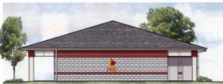
AASU Women's Field House