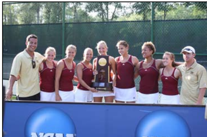
NCAA WOMEN'S TENNIS: NO. 3 AASU 5, NO. 2 LYNN 2

ALTAMONTE SPRINGS, Fla. (May 16) - In a titanic championship match lasting exactly five hours, the No. 1-ranked and defending DII national champion Armstrong Atlantic State men's tennis team erased a 2-1 deficit in doubles to win, 5-4, over No. 2-ranked Barry and capture its second consecutive NCAA Division II Men's Tennis Championship on Saturday in Altamonte Springs.