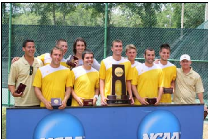
NCAA MEN'S TENNIS: NO. 1 AASU 5, NO. 2 BARRY 4