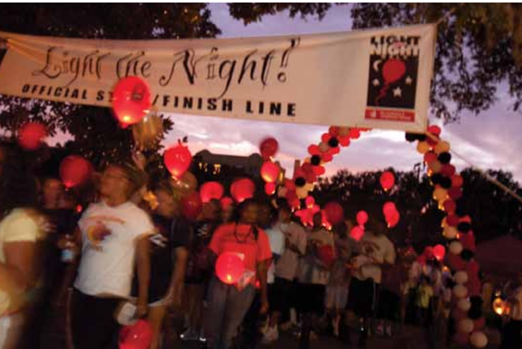
The Light the Night event last fall enjoyed strong support from Armstrong students, faculty and staff who raised nearly $20,000 in support of the Leukemia & Lymphoma Society.

"We make gains in the community with the help of students from Armstrong," he said. "You are a beacon of light."