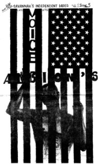
Albion's Voice 3