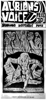
Albion's Voice 2