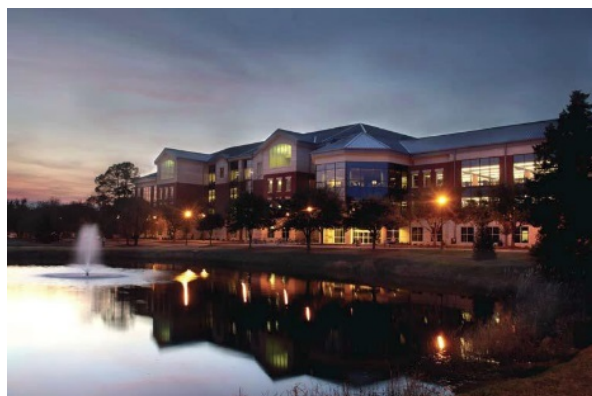
Figure 22 Henderson Library, Exterior