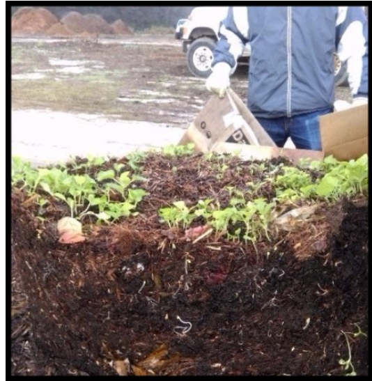
(Left): Students working together to create compost for the new GSU Campus Compost Program with the Center for Sustainability. (Right): Results from student composting.