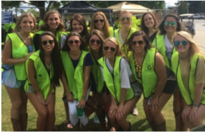
Alpha Omicron Pi sorority volunteers at Georgia Southern (48) vs. Citadel Bulldogs (13) home game, 9/19/2015, a victory for the Eagles and the environment!

Fall 2015 football season for the Eagles was True Blue and Green Too with improvements to the tailgate recycling program. CfS coordinated Tailgate Recycling at each home game in partnership with the Department of Facilities Services and Athletics Facilities, not to mention the help of hundreds of student volunteers from Greek Life, Student Government Association, Environmental Biology classes and more. The "True Blue Recycling Crew" collected #1 & 2 plastic, aluminum cans and cardboard, and kept a whopping 4 tons of material out of the landfill!