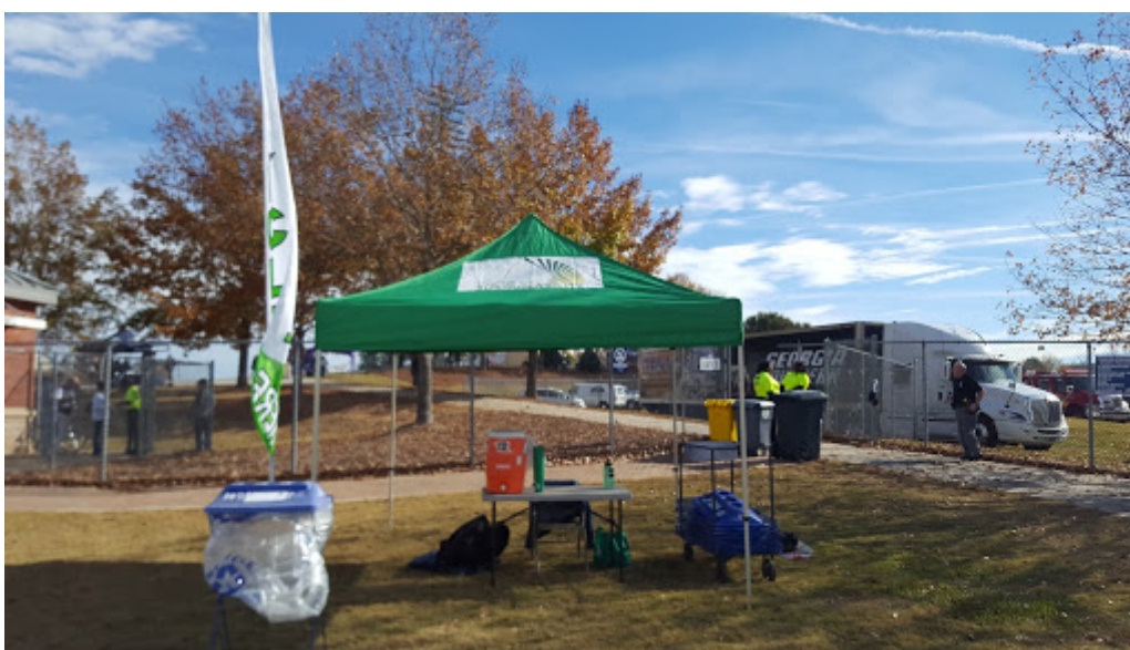
The CfS Recycling Station, set up in the tailgate lot for all home football games.

Fall 2016 football season for the Eagles was True Blue and Green Too with improvements to the Tailgate Recycling Program. CfS continued to collaborate with the Division of Facilities Services and Athletics to increase the diversion rate of aluminum cans from the landfill for the six home games this fall.