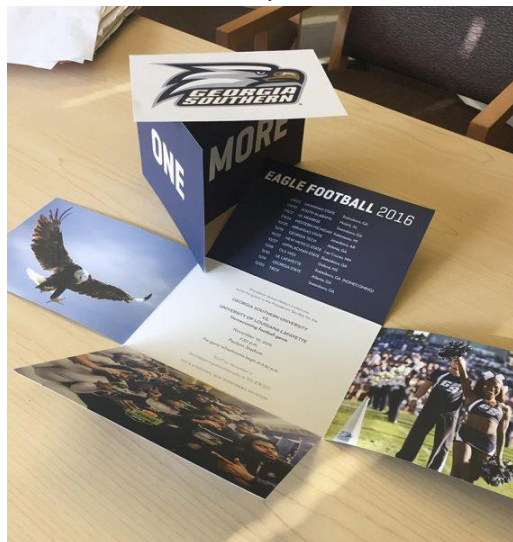
The President's Box Invitation to the 2016 Georgia Southern football games won an Award of Distinction Communicator Award.